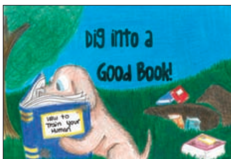
Sixth – Twelfth Grade: Sarah Elsner

Beginning February 1, 2011, each winner's design will be available to new Itasca library card holders. If they choose, current card holders may exchange their current card for a new design for a $3.00 fee.